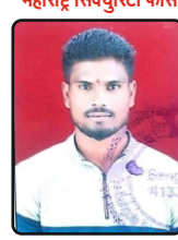
महाराष्ट्र सिक्युरिटी फोर्स